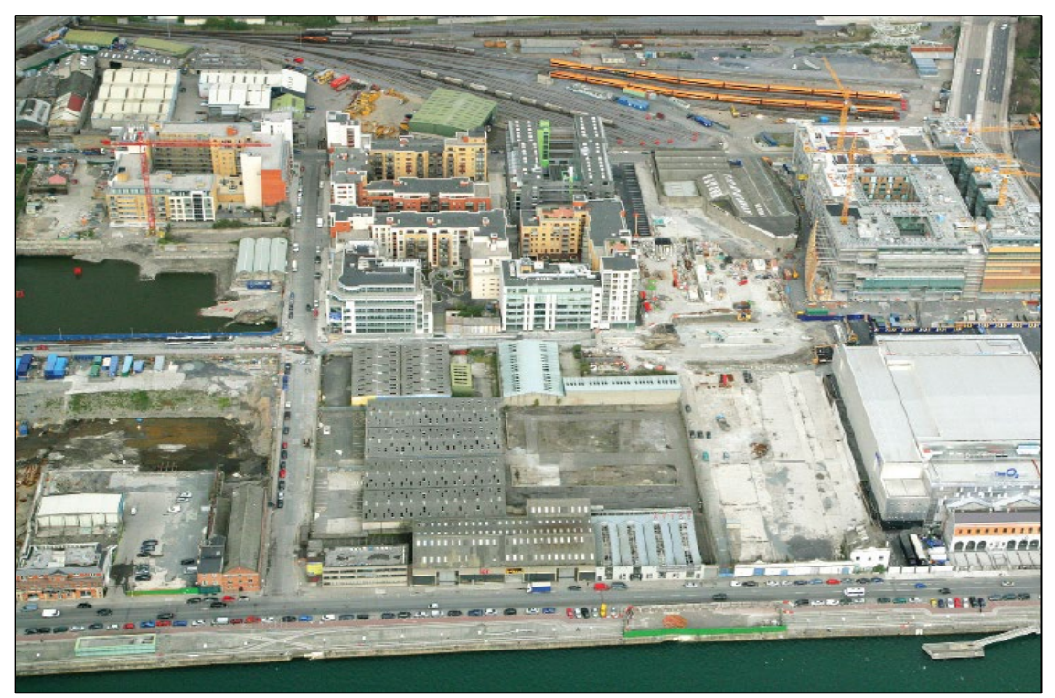
Figure 2.3 : Aerial view showing the structure previously located at City Block 9.

The site is brownfield in nature with the previous structures (primarily derelict and vacant warehousing) having been cleared from the site, as shown in Figure 2.3, below.