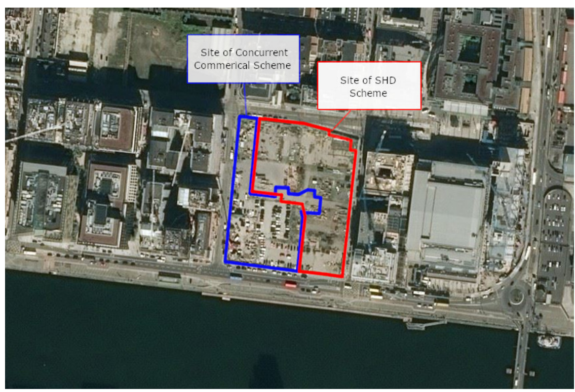
Figure 1.2: Aerial photo showing the indicative boundary of the Subject Site outlined in red, with the balance of the City Block 9 outlined in blue. Source: Bing. Cropped and annotated by TPA, January 2021.

The subject site is principally bounded by: Mayor Street Upper to the north; North Wall Quay to the south; North Wall Avenue to the east; and the residual City Block 9 lands of 0.85 ha to the west. (See Figure 1.1, above.)