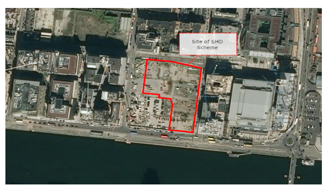
Figure 1.1: Aerial photo showing the indicative boundary of the Subject Site outlined in red, with the balance of the City Block 9 outlined in blue.

Waterside Block 9 Developments Limited<sup>1</sup> (the Applicant) has retained Tom Phillips + Associates (TPA)<sup>2</sup> and Henry J Lyons (HJL)<sup>3</sup> to submit this Strategic Housing Development (SHD) Planning Application in relation to the proposed development at a site of 1.1 ha forming part of a larger site identified as City Block 9, North Wall Quay, Dublin 1, in accordance with Section 5 of the Planning and Development (Housing) and Residential Tenancies Act, 2016 .