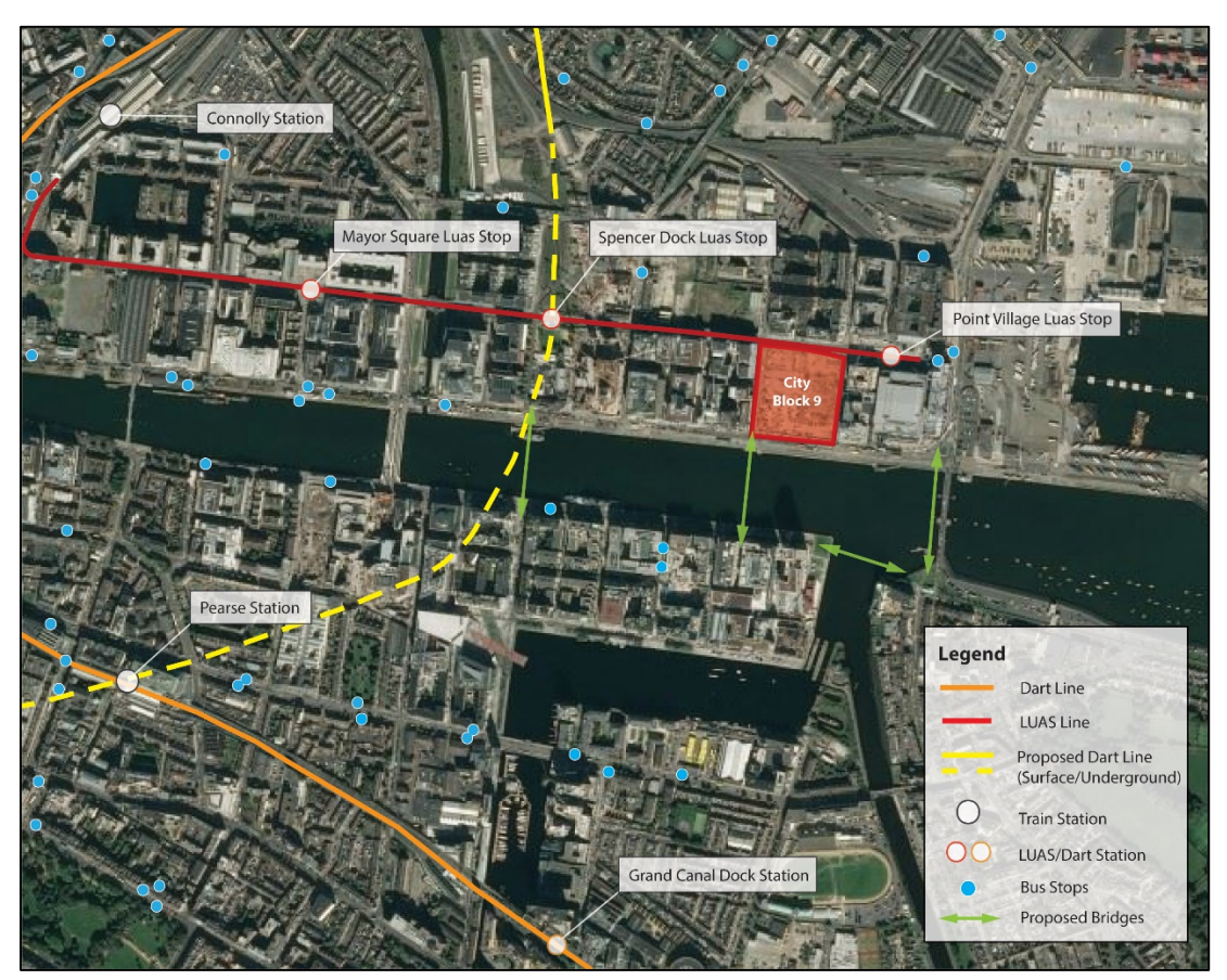
Figure 2.4: Map showing transport routes and nodes located proximate to subject site at City Block 9.

See Figure 2.4, below, which shows the proximate transport routes and nodes in the context of the site at City Block 9.